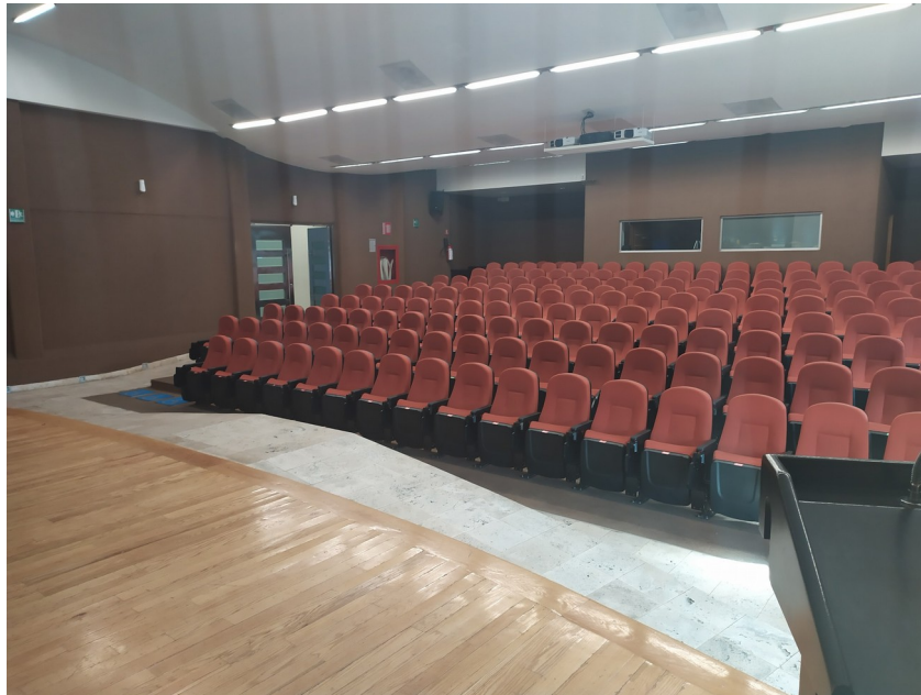
Auditorium: Capacity for 190 people, three spaces for people with different capacities.

Its facilities have adequate areas for communication and dissemination of the CTI, such as: