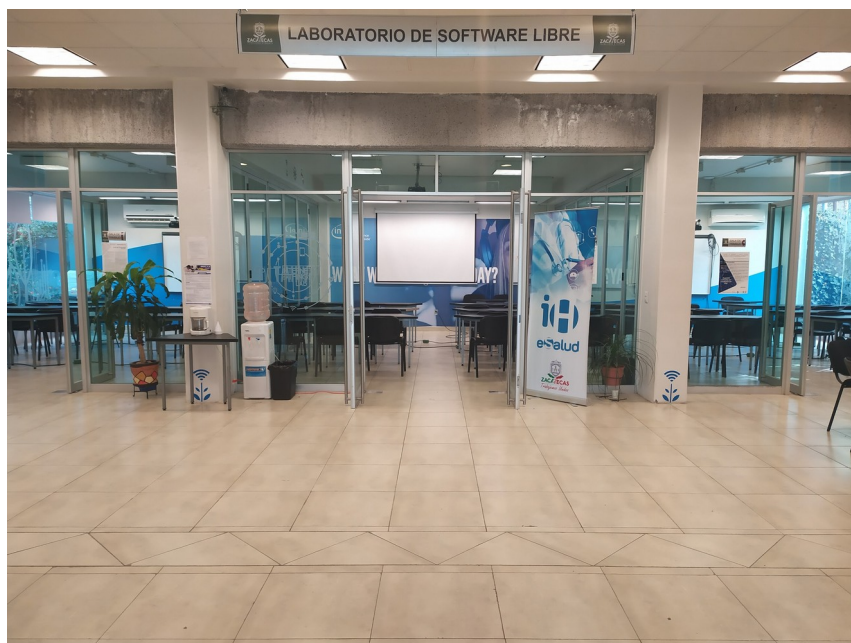
Free Software Laboratory: Three classrooms with capacity for 20 attendees each.