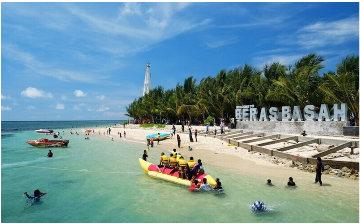
Picture : Scenery around Langkawi Island