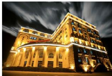
Environment of Southwest University

Southwest University (SWU) is a key comprehensive university, under the direct administration of the Ministry of Education. There are over 60, 000 students live