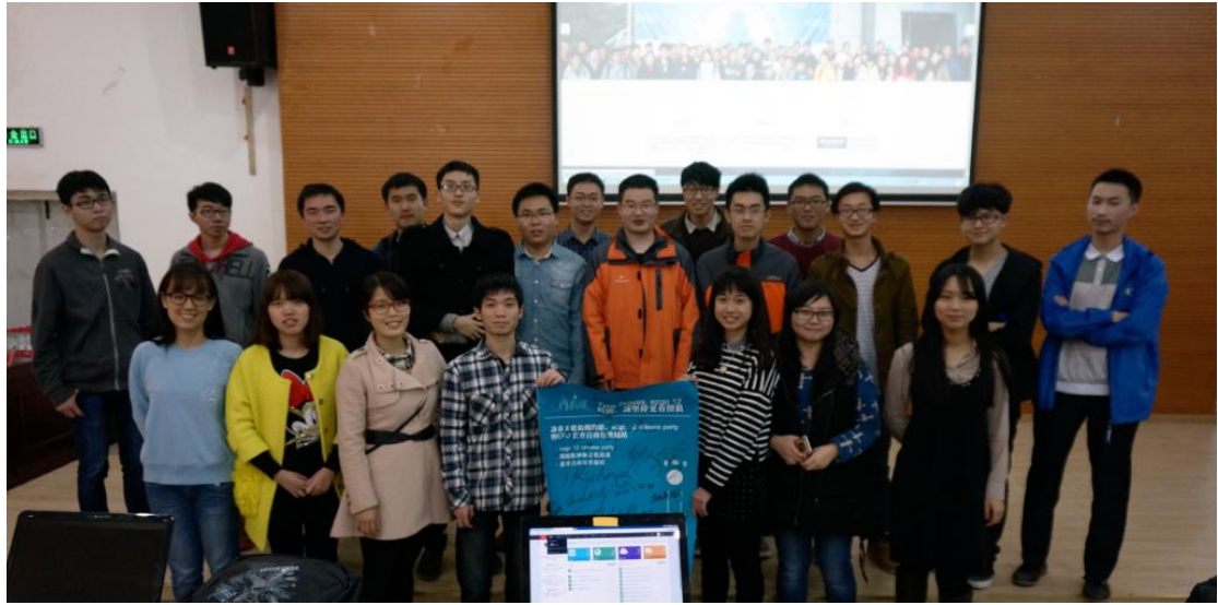
Salons in university