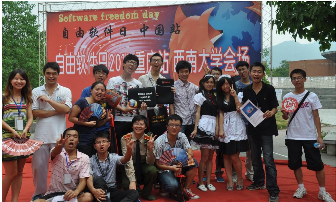
Software freedom day