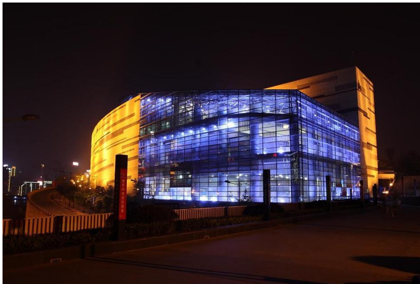
Environment of Chongqing Science and Technology Museum

The Chongqing Science and Technology Museum is a science museum in the Yuzhong District of Chongqing, China. It is the highest level science museum in the southwest China. It has very good conference environment.