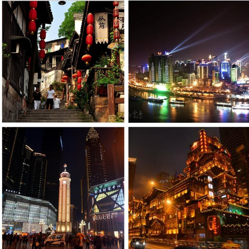
Environment of Chongqing