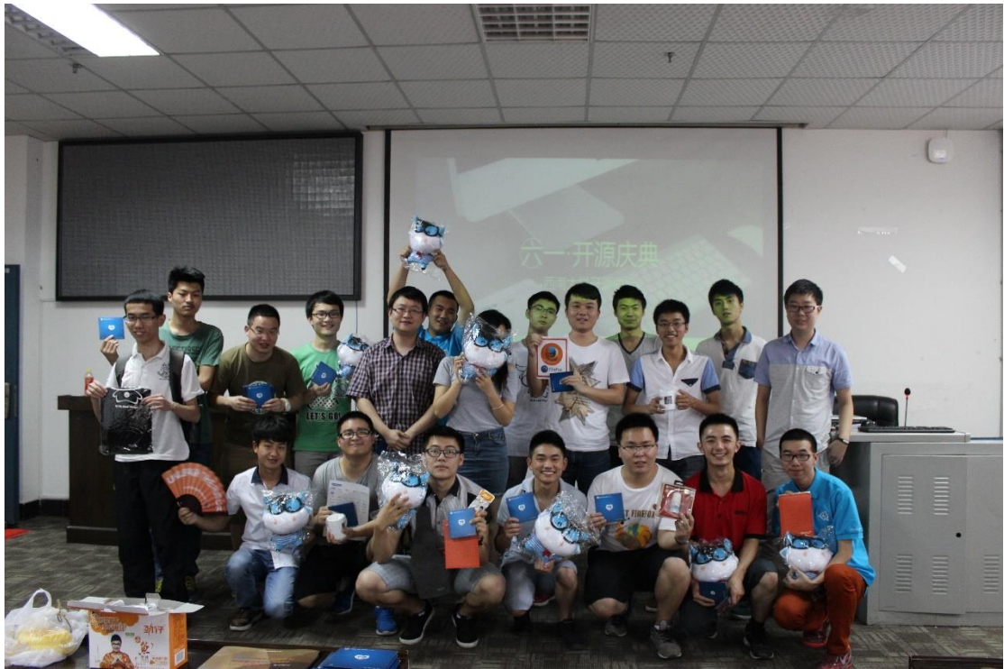
2015 Open source salon for Children's Day