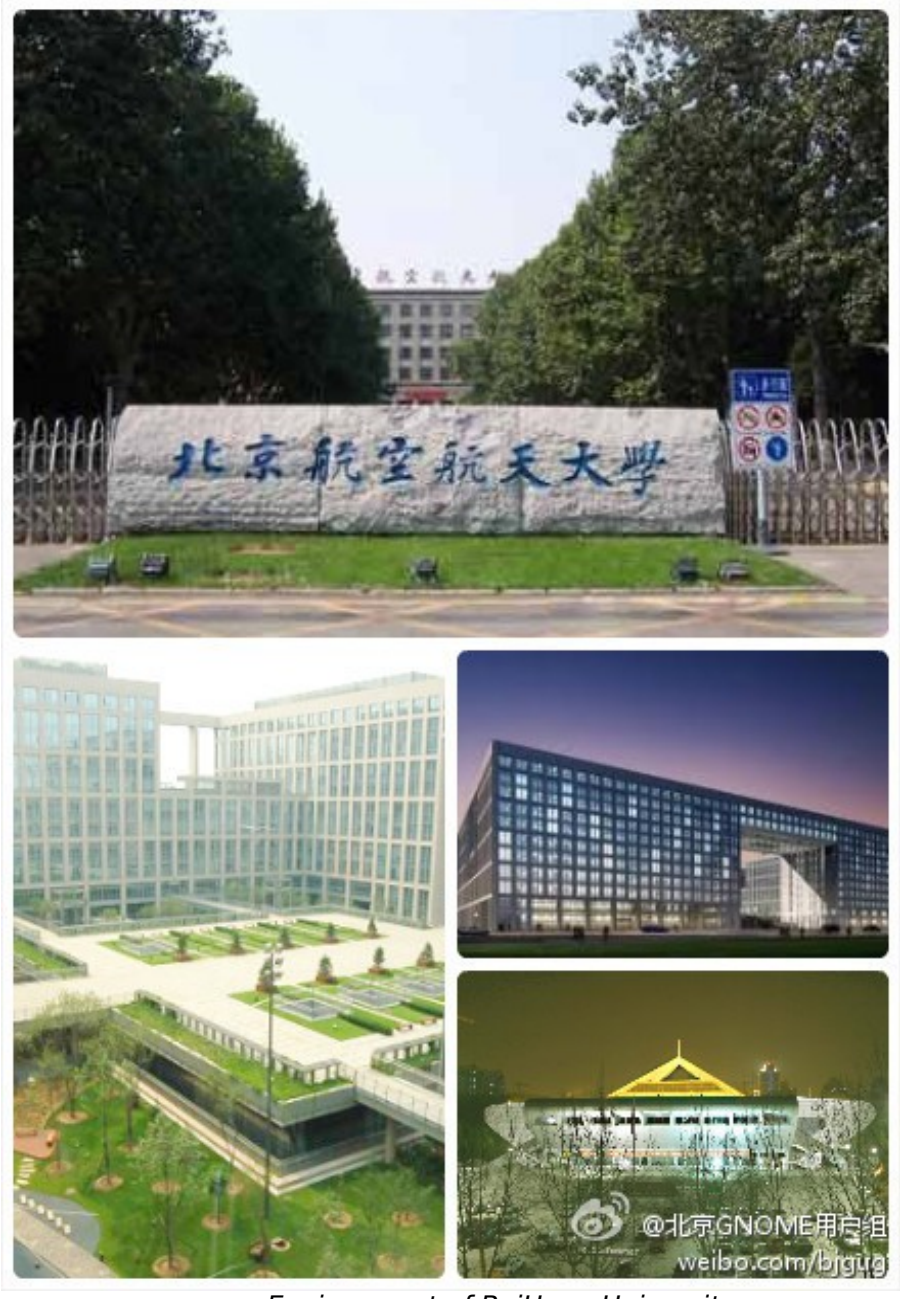
Environment of BeiHang University

As you know in GNOME. Asia 2008 in Beijing we selected this place. And we had cooperated with BeiHang University sever times recently, some small meeting room(~30 persons) is free to use, but for the bigger one, it will need pay, I got the price list from them, we'll talk it later.