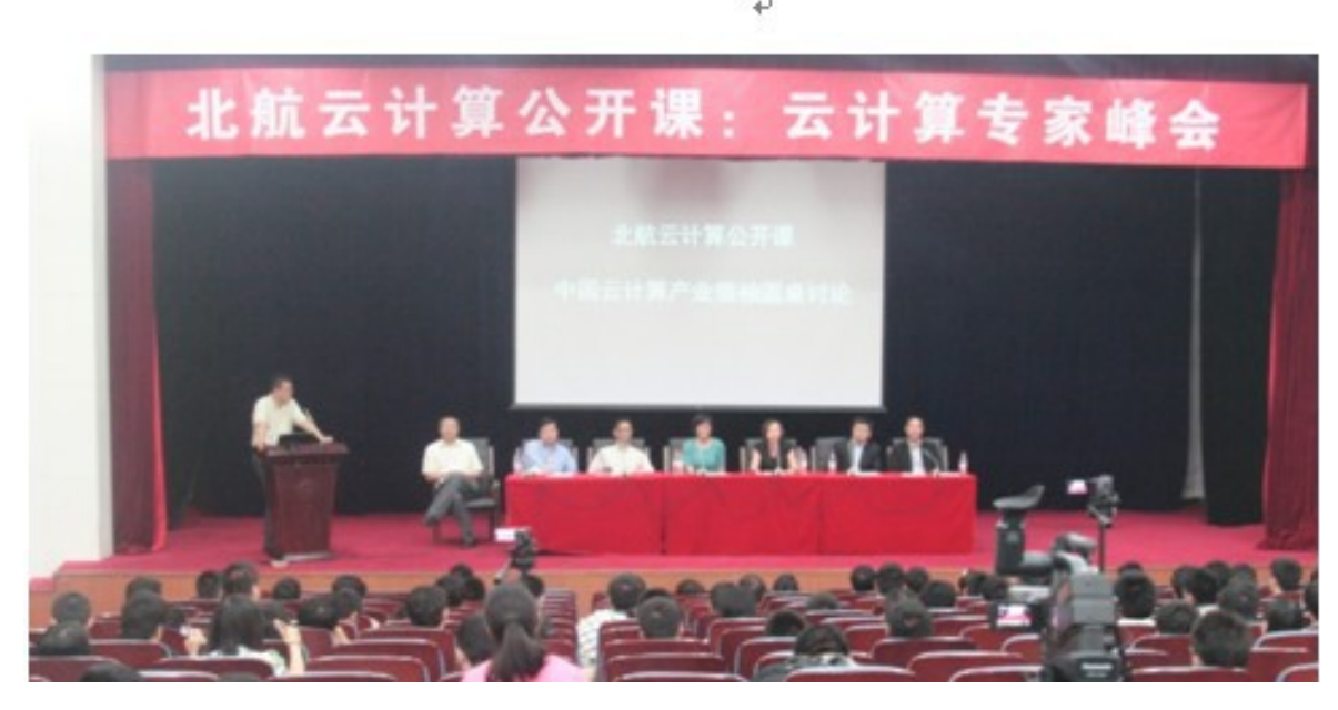
BeiHang University Meeting Centre

Currently we still can't got the picture by ourselves, we could use classroom(~30p) as the hacking room, and the biggest hall looks like below, has 433 seats, which is could be used as our proposed venue.