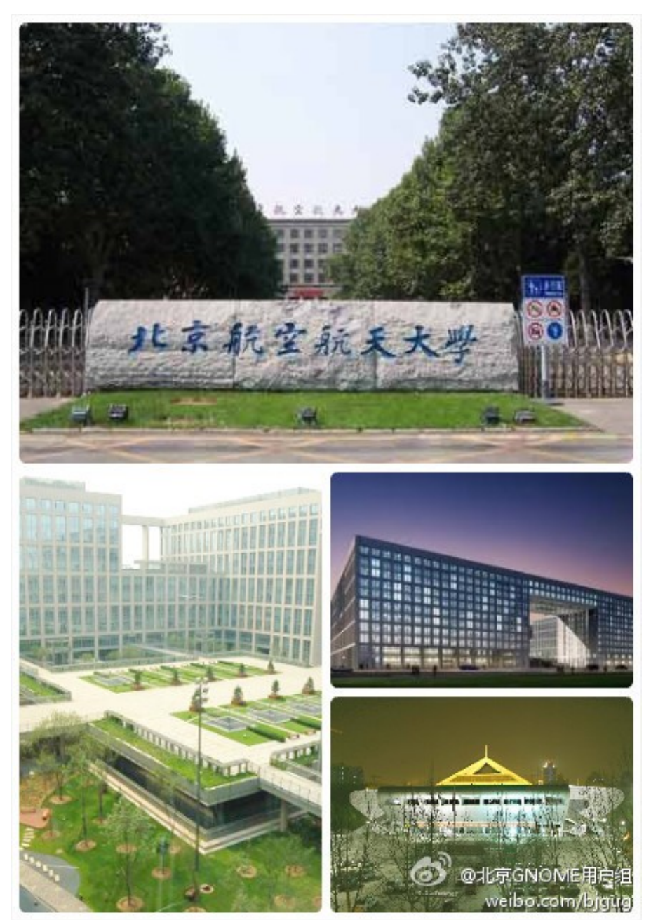
Environment of BeiHang University

The dean of this college is our friend, so maybe we could have some venue in cheaper price, and if we have good luck, maybe for free.