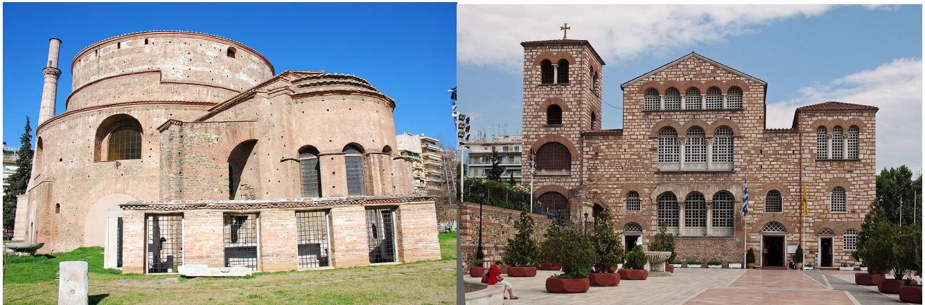
Image #8 - Rotunda (left) and Image #9 - Basilica of Agios Dimitrios (right)

Thessaloniki has an abundance of Christian churches, several of which are older than 1000 years. The oldest, the afore-mentioned Rotunda, is the second-oldest church in all of Europe, as it was built in 306 AD. There are also surviving mosques and synagogues in the city, although much fewer than there used to be and generally not used for regular service: the Yeni Camii and Monastiri Synagogue are examples.