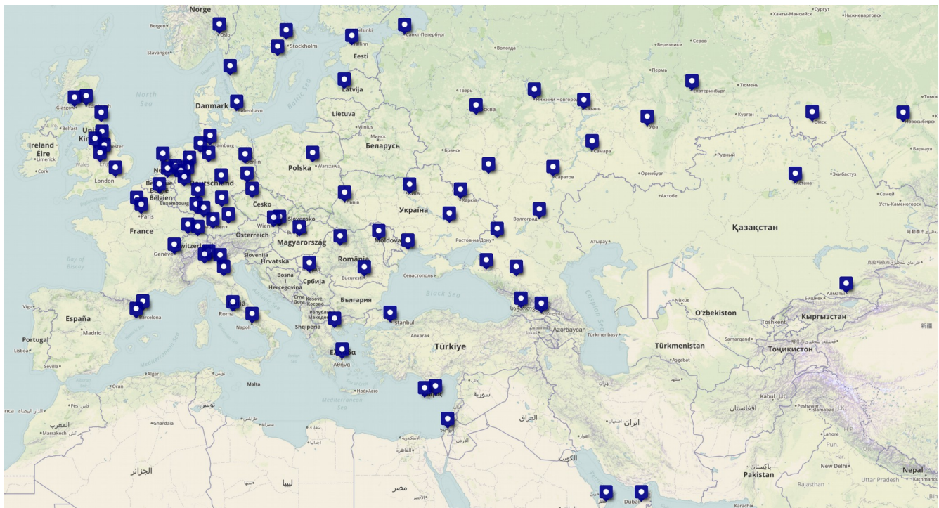
Image #4 – International direct flights to/from Thessaloniki (incl. seasonal, excl. charter) as of August 2018

Thessaloniki is connected by air to several major European cities, especially during the summer season. Major airports in Asia or North America can typically be reached with one connection.